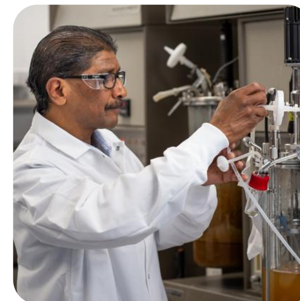
Fermentation & Bioengineering