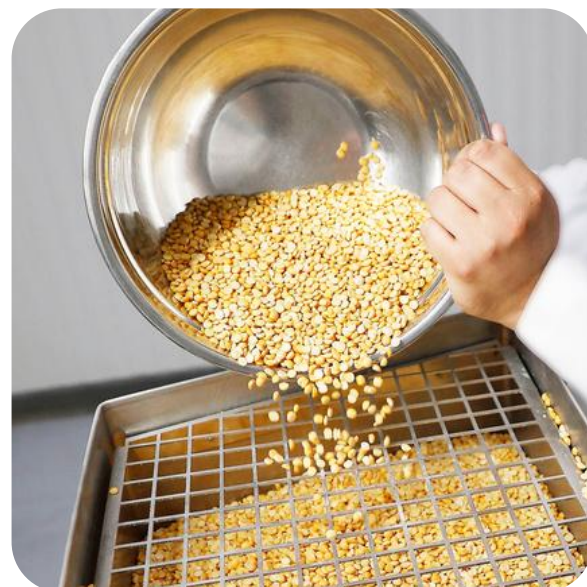
Food Crop Quality Program