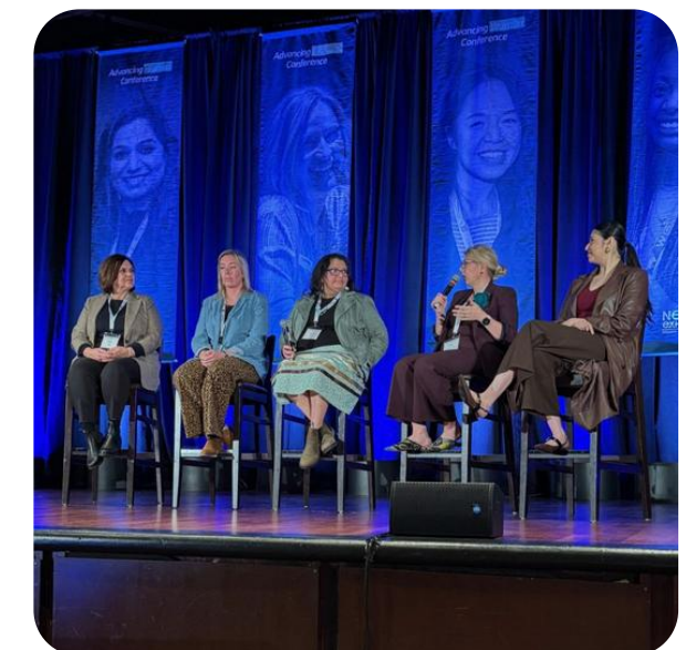
Entrepreneurial Support & Pathfinding