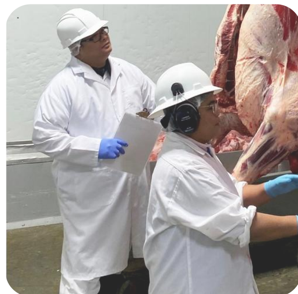
Provincial Meat Inspection