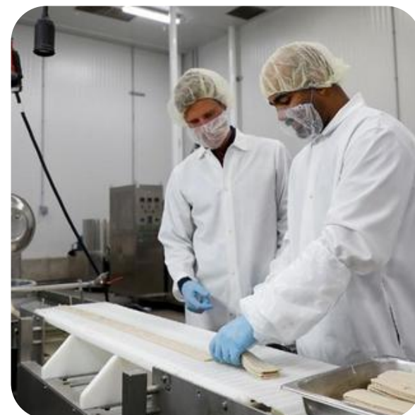
Extrusion Research & Development