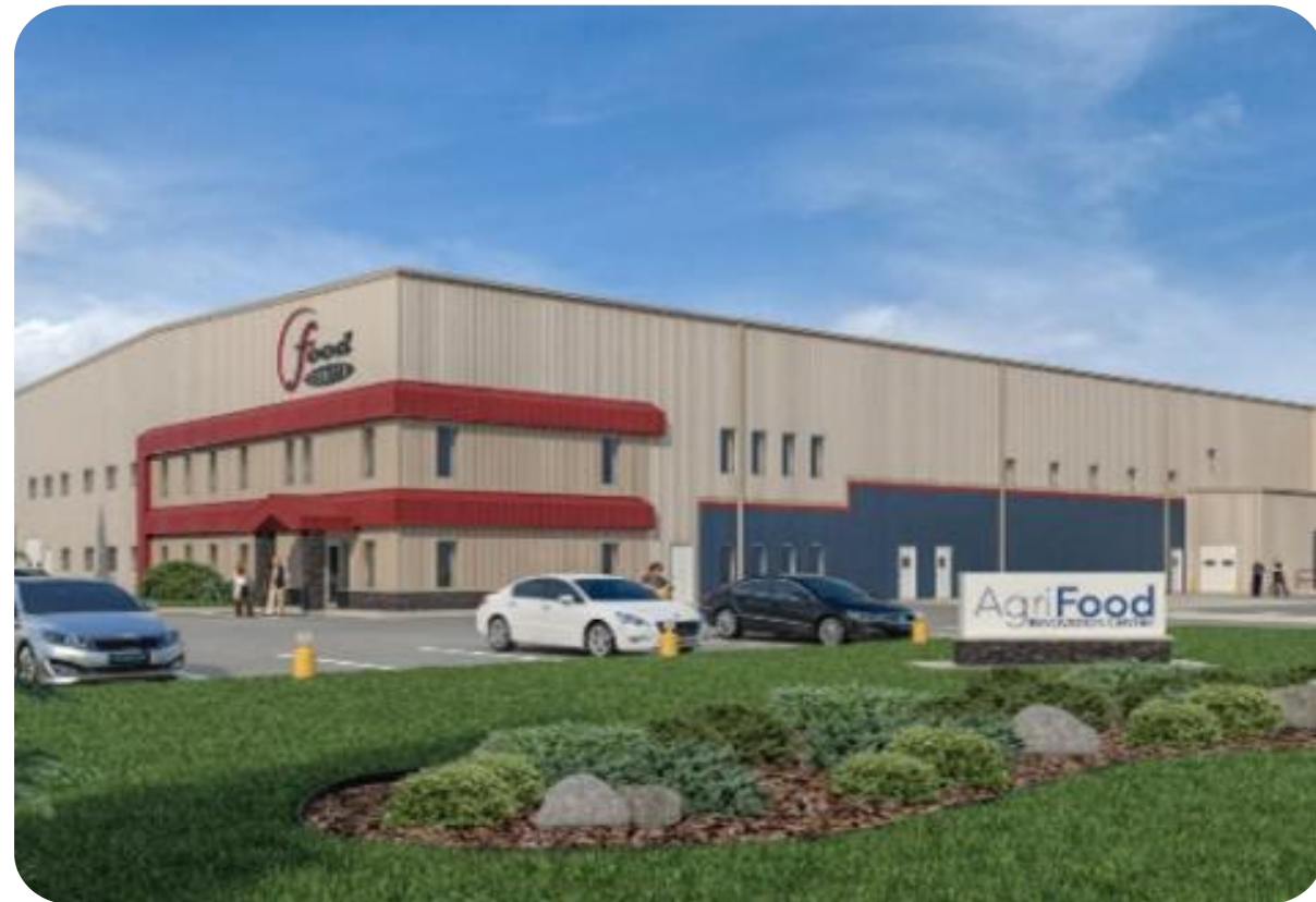
Agri-Food Innovation Centre