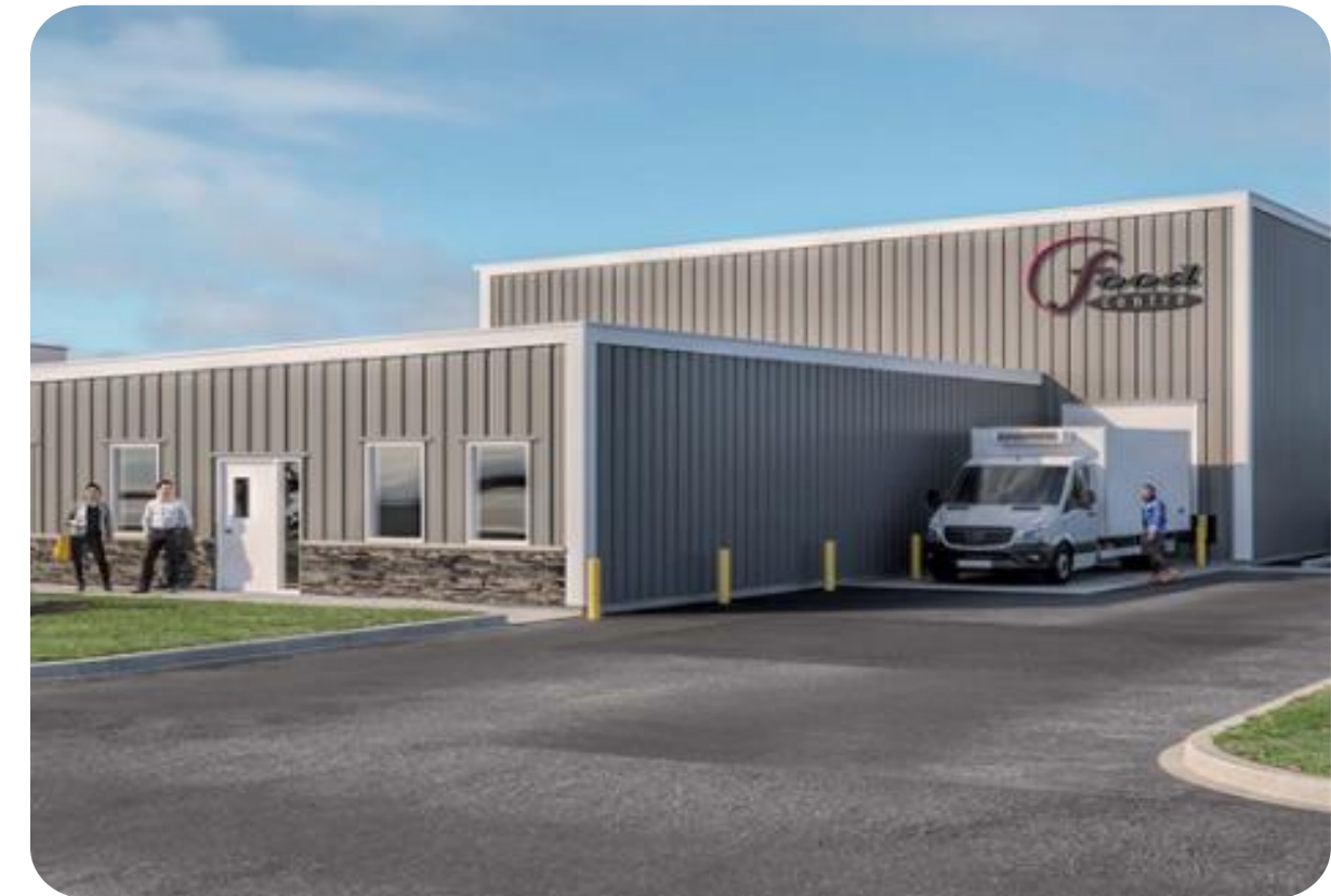
Advanced Food Ingredients Centre