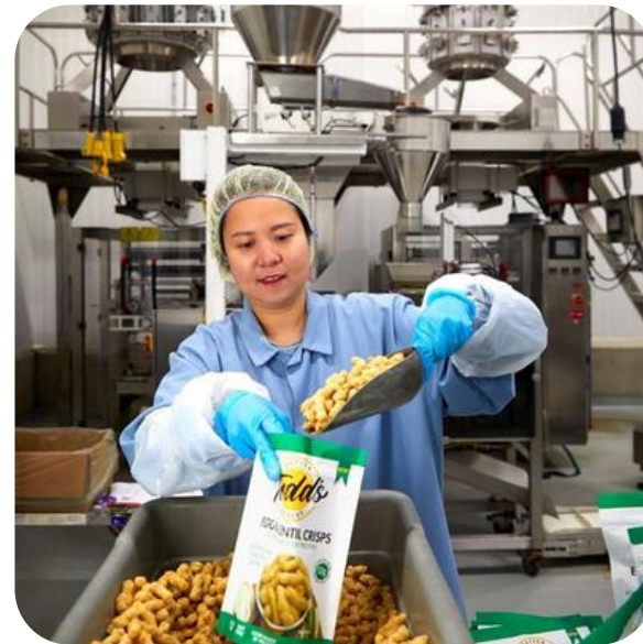
Interim Processing & Co-Manufacturing