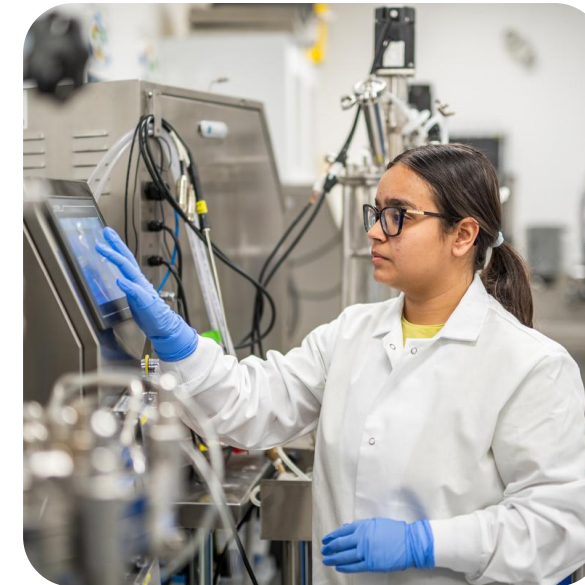
Engineering & Process Authority