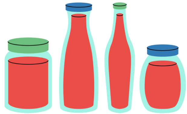
Sauces & Condiments