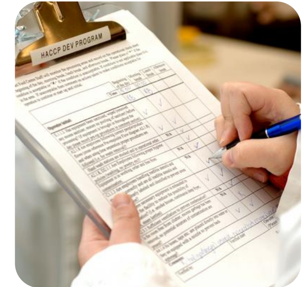
Food Safety Training